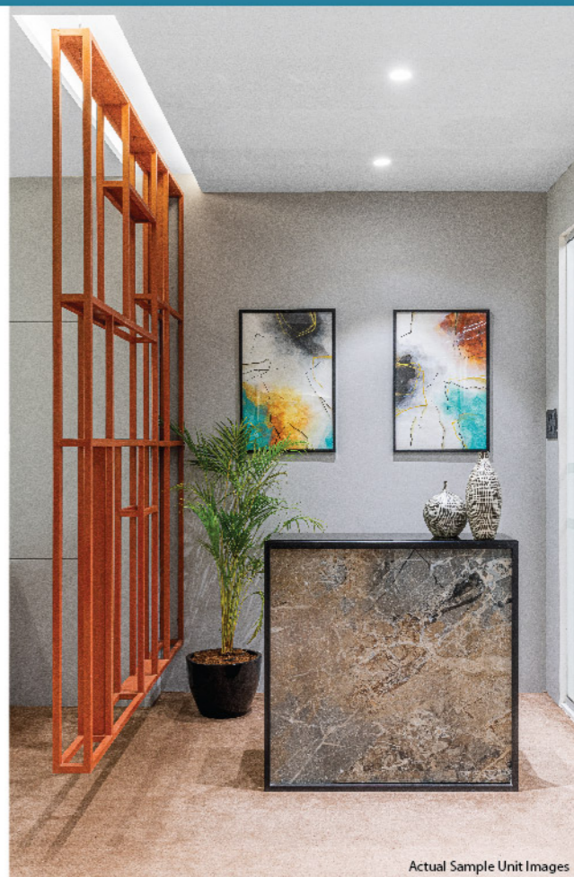
Actual Sample Unit Images